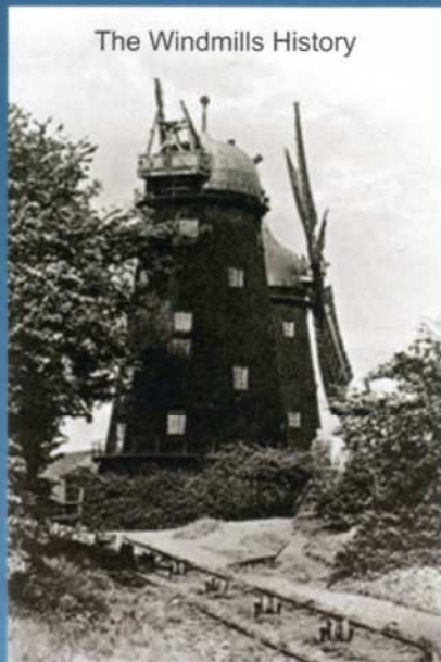
The Windmills History