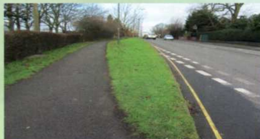
This is how the area looks now. By late Spring/Summer the meadow should be in full bloom.

We are considering a Long Season Meadow type planting which will provide a blend of both spring and summer flowers.